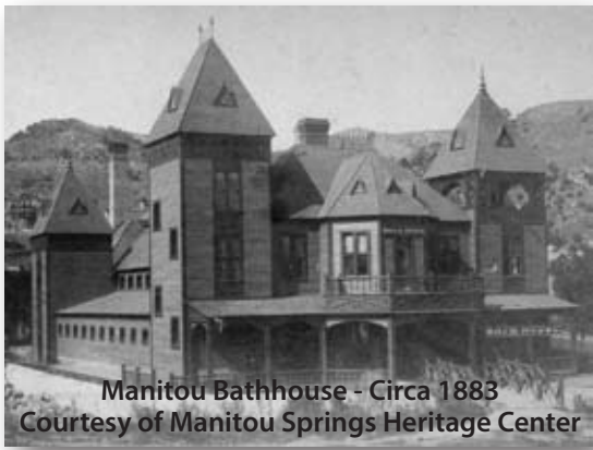
Manitou Bathhouse - Circa 1883